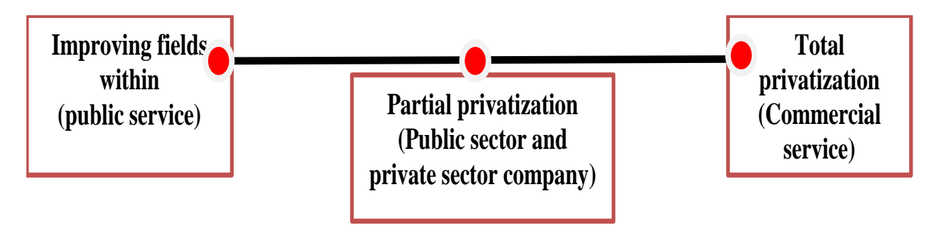
Figure 1. Distribution of entrances directions improving the performance and effectiveness of agricultural extension services worldwide

3- There is no specific approach or strategy that is suitable for the development of the performance and effectiveness of the extension service in all regions, times and conditions, even if the application results in positive results in one or more countries. And that the choice of the entrance or entrances to development should be appropriate and adapted to the local situation (31). The approaches or strategies applied by the country developing the performance in and effectiveness of the extension service can Multiple and vary.