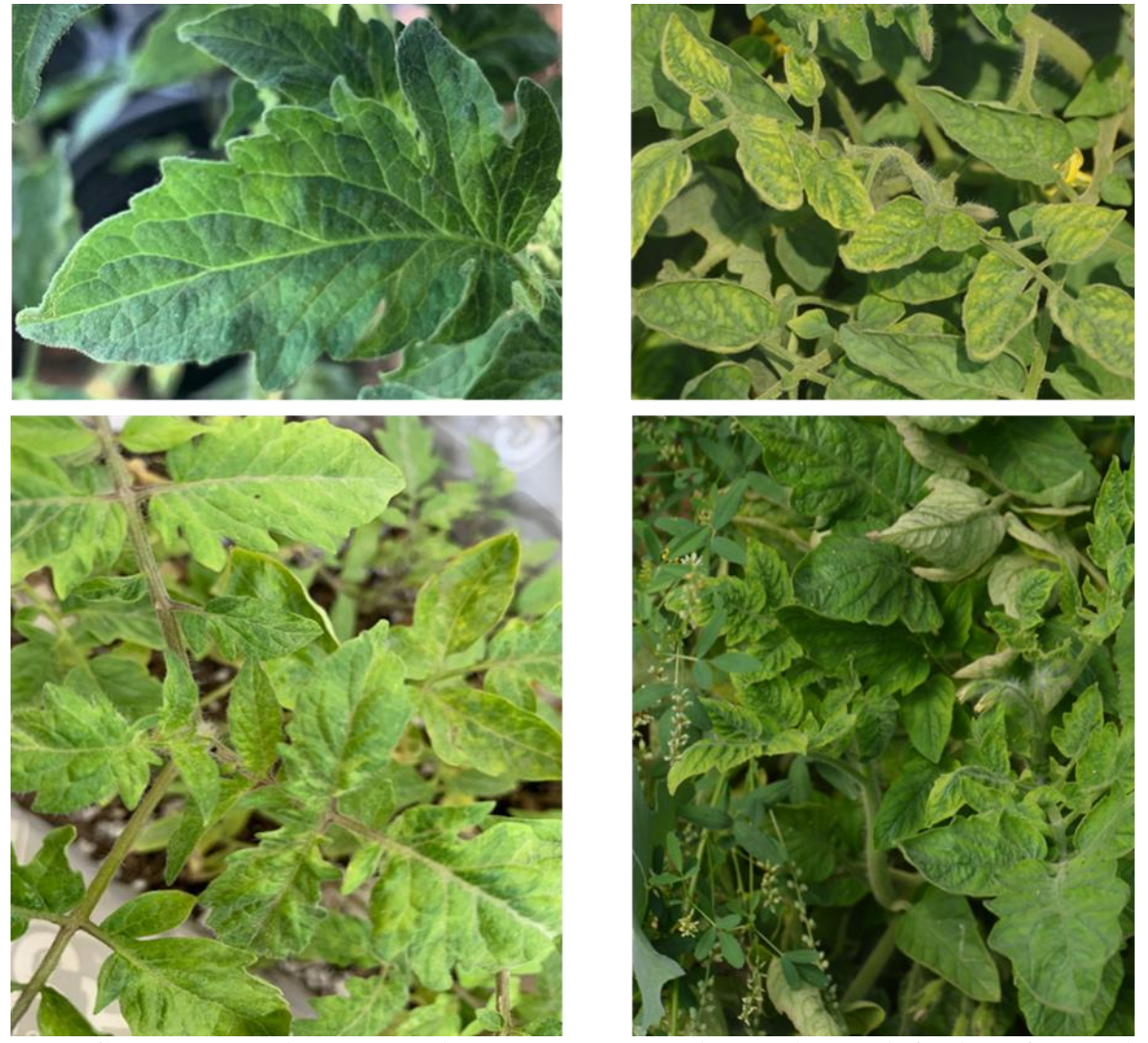
Figure 2. Common mosaic and mottling symptoms associated with the infection of TMV (left) and CymMV (right) were observed on tomato plants in different tomato cultivation areas in Iraq. The virus infection was confirmed serologically using immunostrip tests