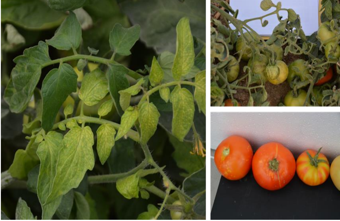
Figure 1. Chlorotic and yellow blotches (A), followed by brown spots, and rugose wrinkles (B) and lines appearing on tomato fruits (C) were observed in tomato fields located in Diyala and Basrah. These plants were detected positive to ToBRFV

certification of tomato propagation material, as mandated by legislation. However, this is not true for the majority of the viruses belonging to the tobamovirus and potexvirus groups, which are the focus of our research. The lack of symptoms observed in the plants included in our experiment provides evidence of the minimal harm posed by these viruses to tomato production. Consequently, it is unlikely that these viruses will be included in certification schemes for the propagation of tomato cultivars. However, caution should be exercised when transferring agricultural materials, as it is the primary method for spreading tomato viruses.