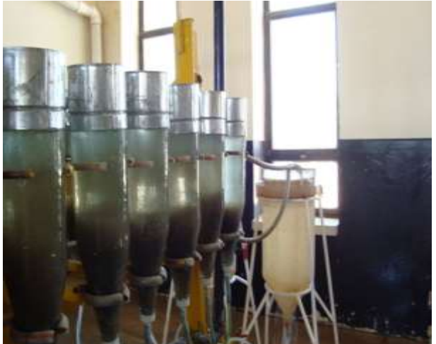
Figure 1. incubators in Al-Wahda fish hatchery.

Hatching rate % = amount of hatching fries / amount of fertilized eggs× 100