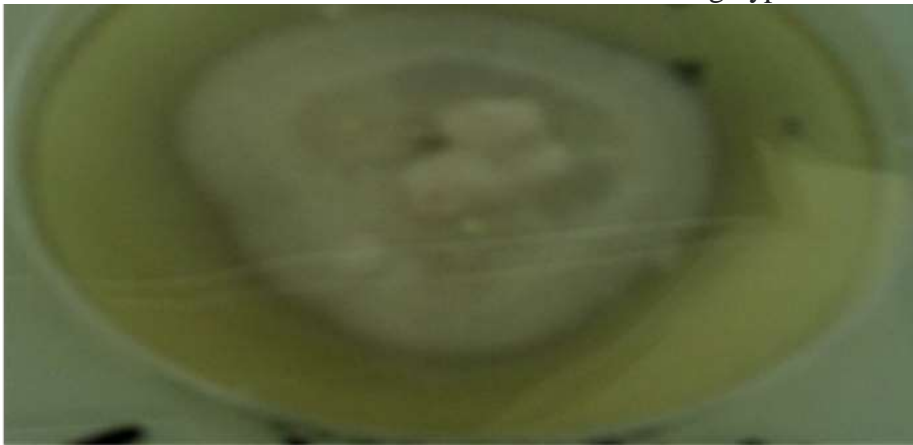
Figure 1. T.verrucosum colony on SDA

T. rubrum : after 7-10 days of incubation at 25°C on SDA, colonies appeared as fluffy wool smooth in texture, white-creamy while the back of the plate was brown(Figure.3) When staining by cotton lactophenol cotton blue showed large elongated conidia like tear with divided long hyphae.