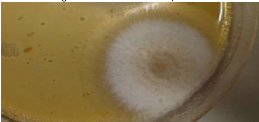
Figure 2. T. mentagrophytes colony on SDA