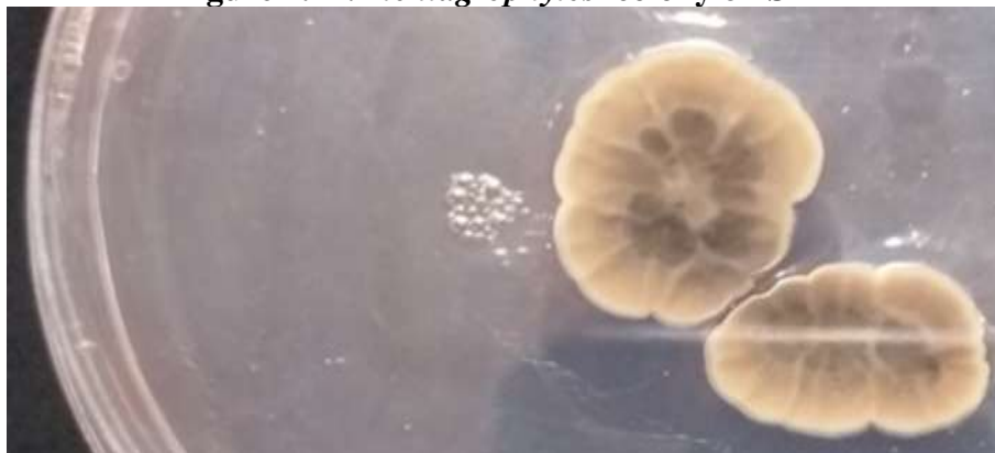
Figure 3. T. rubrum on SDA