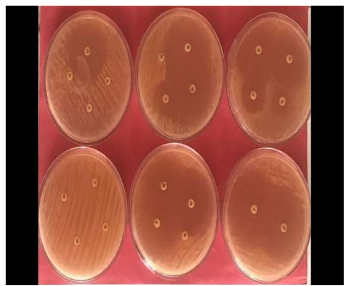
Figure 5. Disc diffusion method of antimicrobials susceptibility test of R.mucosa isolates.

and Sulfamethoxazole (5). Also Shayuan and his coworkers reported that, R. mucosa isolated from patient with systemic lupus erythematosus exhibited large inhibition zone for most of antimicrobials tested (22). On another hand in 2018, Koh et al. reported a genus belong to Roseomonas. A species of pink-pigmented bacteria has been related with numerous primary of hospital-acquired infections; though, its nosocomial infection had never been reported before and the sources of these isolates were from the different samples collect from the hospital environment (14). The global research in addition to the recent finding may reflect the increasing bacterial resistant against empirical antimicrobial agents. Thus, real treatment of particularly such bacterium in immunocompromised patients by catheter removal may be needed. Antimicrobials alone can fail to eliminate catheter related sepsis regardless of achieving therapeutic levels as Alcala et al. mentioned (2).