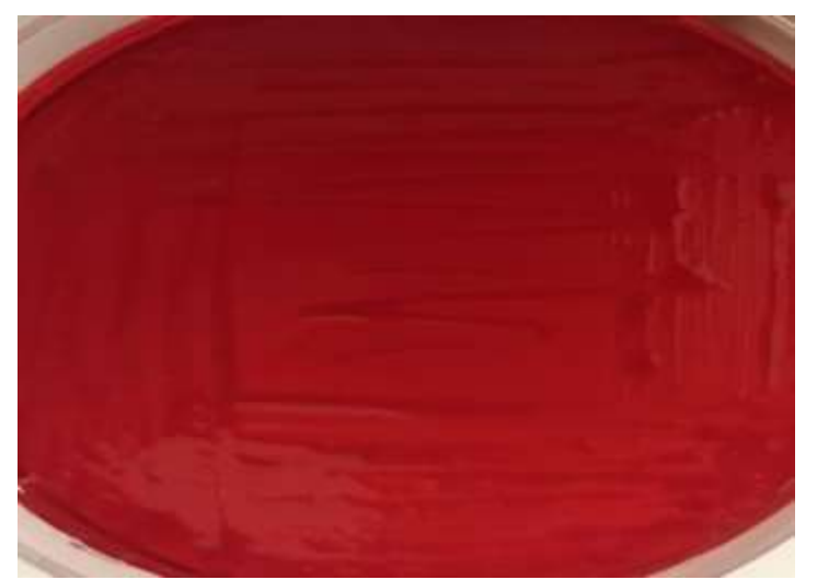
Figure 4. Non-Biofilm producer R mucosa on congo red agar.

Figure 3. Capsular detection of Roseomonas mucosa isolate. the isolated bacteria has weak capability to produce biofilm on Congo red agar as showed in figure 4. Non-biofilm producer colonies usually remained pink to red on Congo redagar as Freeman et al documented (7).