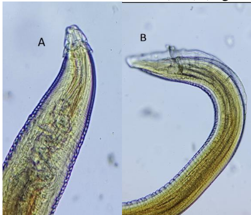
Figure 1.A, Anterior and B, posterior end of Parabronema skrijabini (male)

Microscopic investigation results showed characteristics features of adult Male about 102-117 \mu\text{m} in wide. Buccal cavity 93-112 \mu\text{m} deep. The tail is coiled ventrally, with lateral alae at the posterior extremity. Spicules are distinctly unequal. Adult Female worm, Worm is 192 \mu\text{m} in width. The tail is pointed or blunt and distinctively curved on the dorsal side. These features matched with (9, 3) (Figure 1).