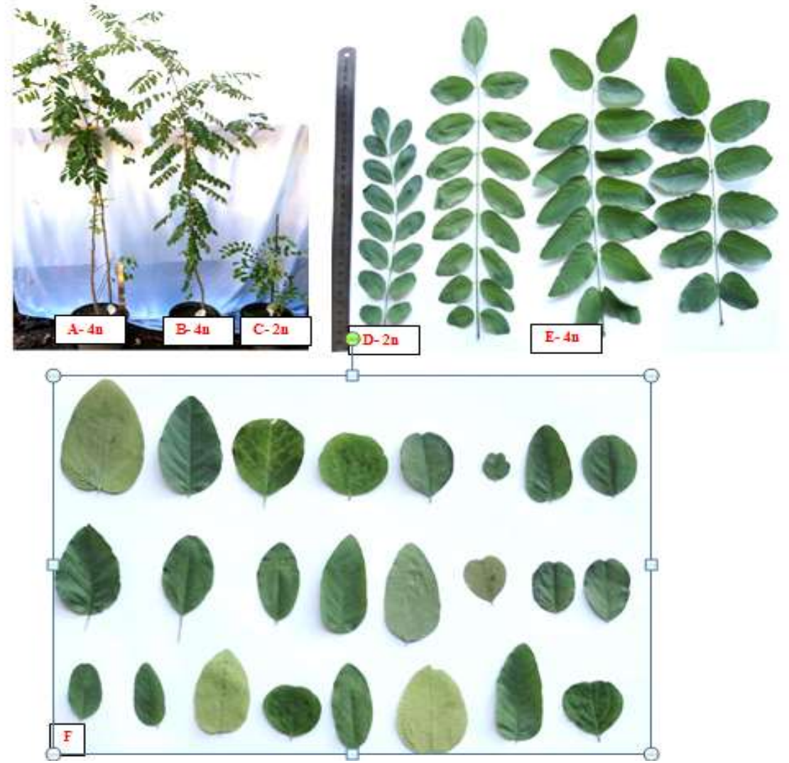
Figure 3, Robinia pseudoacacia L. Seedling and leaves grown in greenhouse at 8 months old. (A, B) Triploid plant.(C) Diploid plant. (D) control leaf were (E) treatment with colchicine leaves. (F) untreatment leaflet were others are the deformed leaflet of treated seedlings with different colchicine concentration with different exposure time

Note: Means \pm standard deviations of 3 independent replications in the same column followed by the same letters do not differ significantly (p<0.05) as determined by Duncan's multiple range test Red indicates the lowest mean of seedling survival and seedling morphological characters Blue indicates the highest mean of of seedling survival and seedling morphological characters